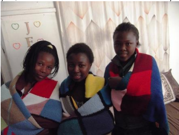
Being held in God's Hands